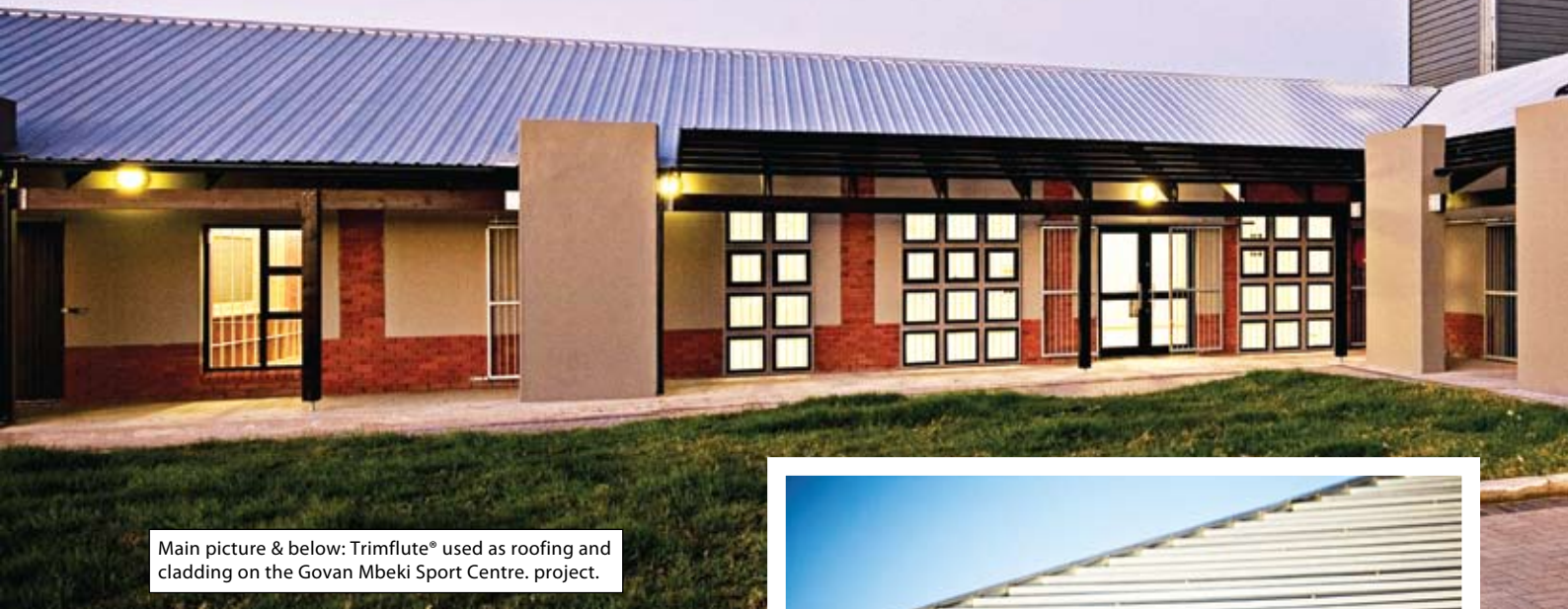
Main picture & below: Trimflute® used as roofing and cladding on the Govan Mbeki Sport Centre. project.

“ADD THE GOOD LOOKS OF A REALLY ELEGANT PROFILE THAT IS VISUALLY DISTINCTIVE, AND EXPERT METAL SHEETING THAT WILL DEMONSTRATE REAL VALUE IN BOTH DESIGN AND FUNCTION.”