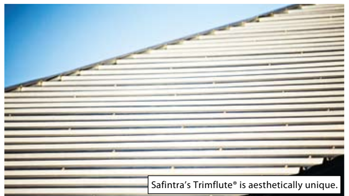
Safintra's Trimflute® is aesthetically unique.