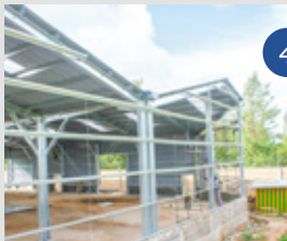
Installation of wall girts and braces