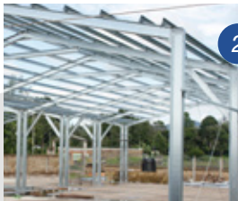
Erection of fabricated portals