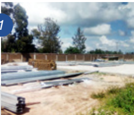
Supply of material at site